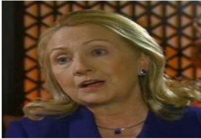
Hillary Clinton in full support of Syrian terrorist rebels.

This is a war being fought by minorities; this is a war of a noisy few against a silent majority. The Syrian government has tried again and again to sue for peace, making meaningful concessions along the way. This has failed and tens of thousands of Jordanian, Iraqi and Turkish Al-Qaida men continue to flood into Syria to kill and maim her people. At the conclusion of this war, if the "rebels" are victorious, the right to live in Syria as an ethnic or religious minority will be revoked. Equal rights for women and homosexuals will be destroyed. A radical sharia regime will take over. It's easy for RTE and Sky to speak. As mouthpieces of the imperial world they play an important role and will all benefit from terrorists governing Syria.