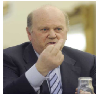
Minister Noonan has been quiet clear about how much he cares about the tens of thousands forced to leave.

Immigration is a clear symptom that an economy is in free fall; of course we already know that. What many don't know though, what many are failing to grasp, is just how close any unemployed person is, at any given time, to having to follow the boat and plane loads of Irish men and women who've been forced to abandon their life in this country in a desperate flight for a basic human right; work. The figure for immigration out of this country between April 2011 and April 2012, just twelve months, stood at 87,100. These are 87,100 sons or daughters, these 87,100 are friends or loved ones, and looking from a larger perspective this number equates to taking the whole city of Limerick and sending it abroad.