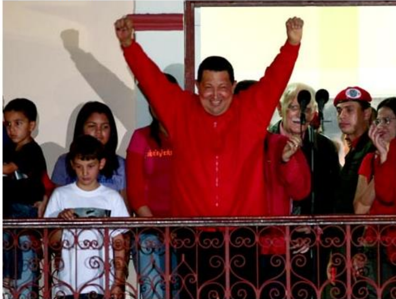
Hugo Chavez celebrates election victory. President Chavez was strongly endorsed by his people and saw off a US backed rich opponent.

These communist electoral victories show a clear rise in the tide of working class power all across Europe, marking a general increase in the resistance of workers to the malign influence of the neoliberal regimes that violently impose austerity and economic inequality in Europe. These victories sound out a hopeful note internationally, along with the triumphant victory of Hugo Chavez in Venezuela, and are creating an atmosphere of expectation for future successes in many places. Only by the tireless and passionate work of party activists can these victories be consolidated and expanded. The fight to reclaim worker's rights and benefits all across Europe will be difficult and long, but will inevitably end in victory.